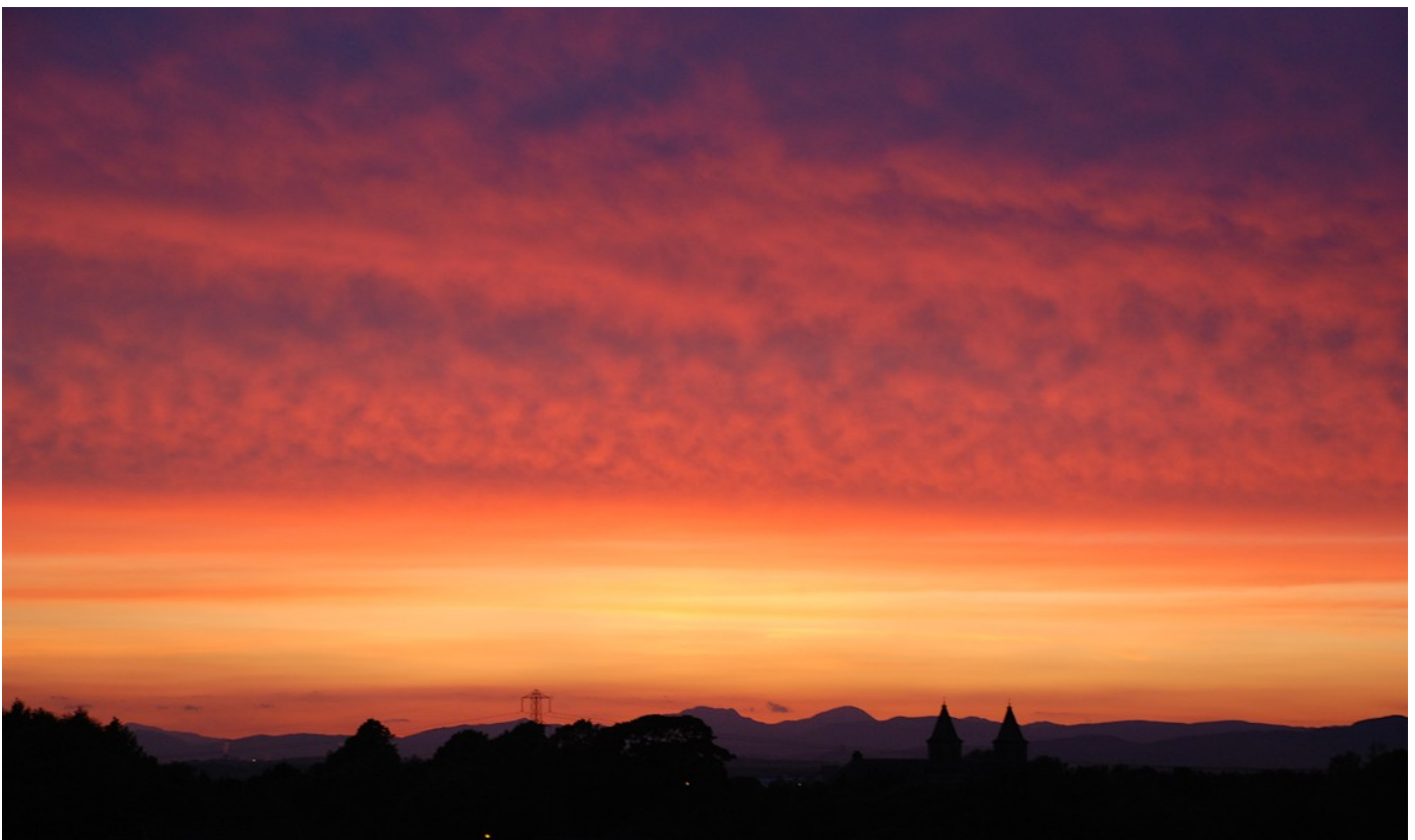
Autumn Sunset over Polmont

Householders should take the precaution of not putting their refuse bins out for collection overnight when they could be stolen and used for bonfires. For those thinking of using plastic bins on bonfires you need to be aware that the toxins that this produces can cause serious injury or worse. You have been warned.