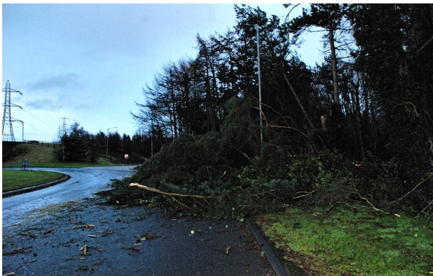
Fallen Tree at Cadgers Brae Roundabout after the early January Storms